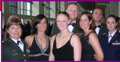
All-States Banquet! Time to dress up!